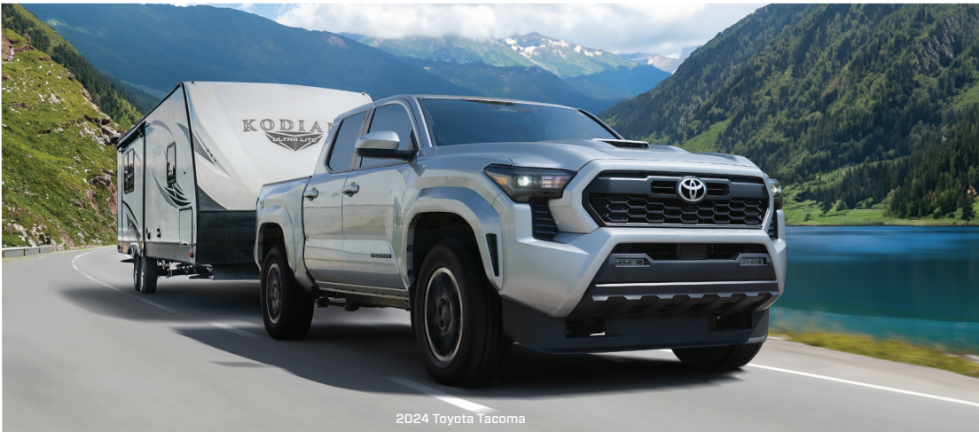
2024 Toyota Tacoma